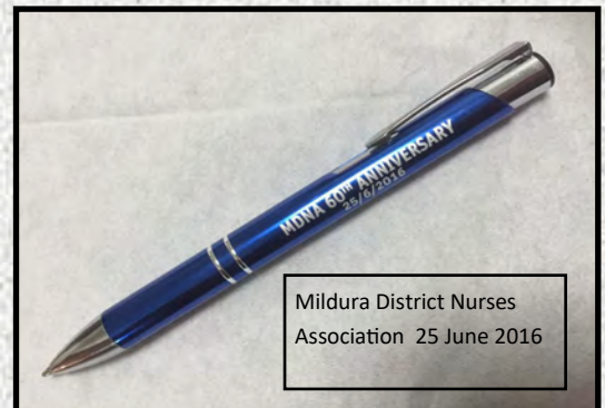
Mildura District Nurses Association 25 June 2016